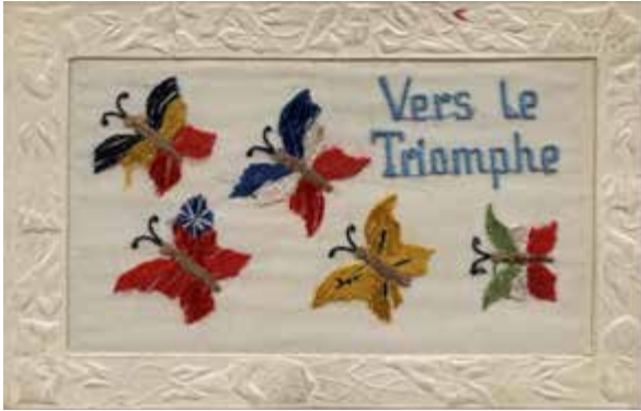
World War One silk embroidered postcard Liverpool Central Library & Archive

The First World War was the start of a period of great social change and educational development, reflected in the archives and special collections held in Liverpool's libraries. Some fascinating original documents, never publicly exhibited before, are on show during the summer of 2014 as part of the city's contribution to the national centenary commemoration of the First World War.