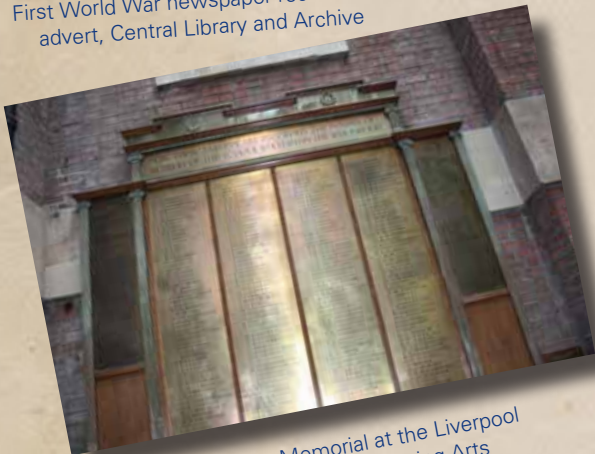
The War Memorial at the Liverpool Institute of Performing Arts