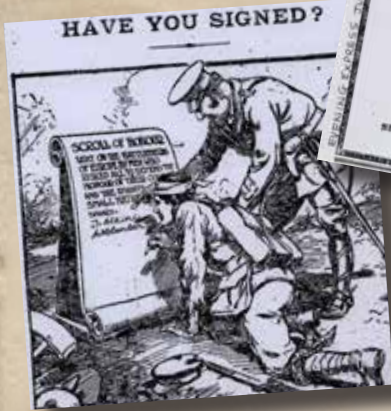
First World War newspaper recruitment advert, Central Library and Archive