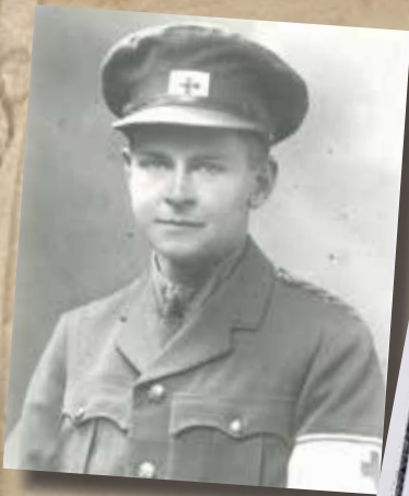
Olaf Stapledon, science fiction writer and member of the Friends Ambulance Unit, University of Liverpool