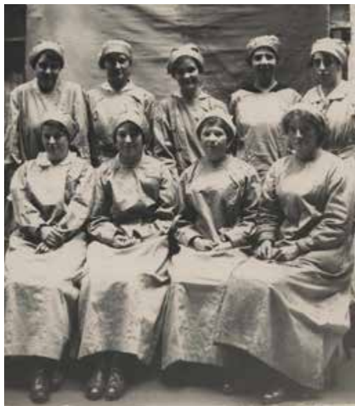
Munitions girls (dated June 22 1918)